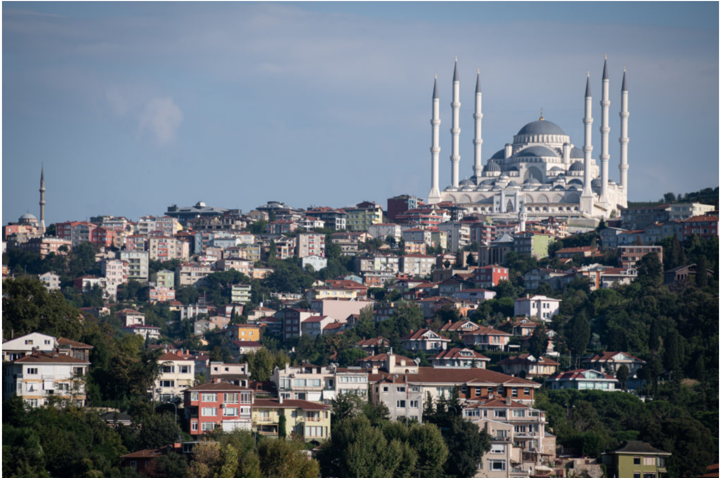
The new Camlica Mosque rises over the Bosphorus water way in Istanbul, Turkey.

Naomi Rea ( https://news.artnet.com/about/naomi-rea-419 ), September 16, 2019