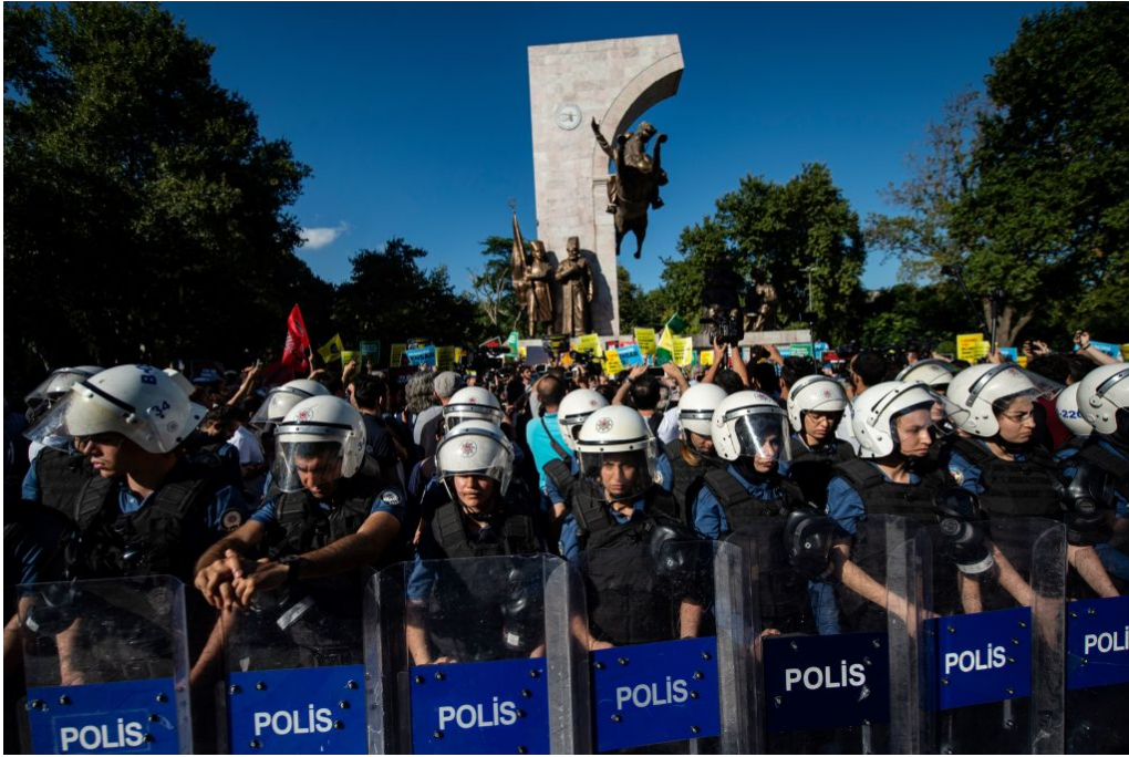
Turkish anti-riot police officers stand guard as demonstrators gather on July 27, 2019, in Istanbul to support refugees and demonstrate against the Turkish government's recent refugee action.