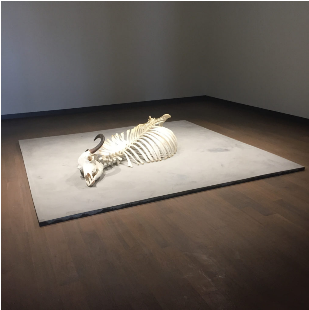
Ozan Atalan's work Monochrome in the Istanbul Biennial.